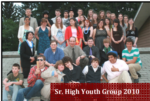
Sr. High Youth Group 2010

I have no idea where I am going to be in ten years, I don't even know where I will be in 5 months! But I'm sure I will be being God's hands and feet.