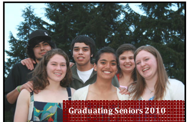
Graduating Seniors 2010